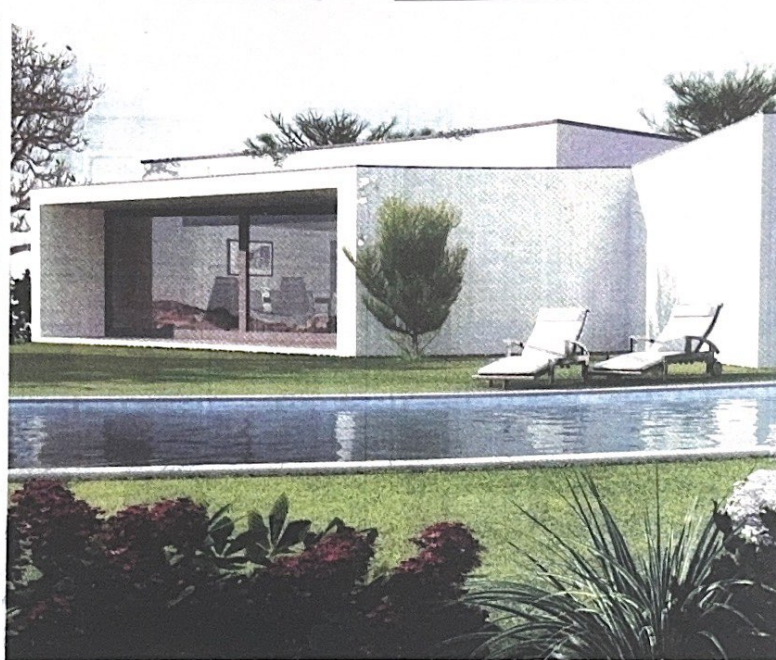
Glass act: the 1920s Weissenhof Estate in Stuttgart, middle left, is the model for the villa by Alvaro Siza Vieira, left, and another by Eduardo Souto de Moura, bottom far left, at Bom Sucesso near Obidos, top far left. José Mourinho, below, Chelsea's manager, is among those to sign up for a house there